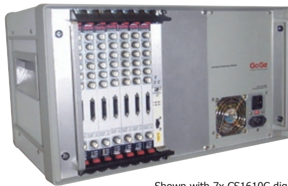
Shown with 7x CS1610C digitizers and MXI-3 card. (Digitizers not included with IMF8000C.)

CompactPCI chassis for CompactPCI/PXI CompuScope cards